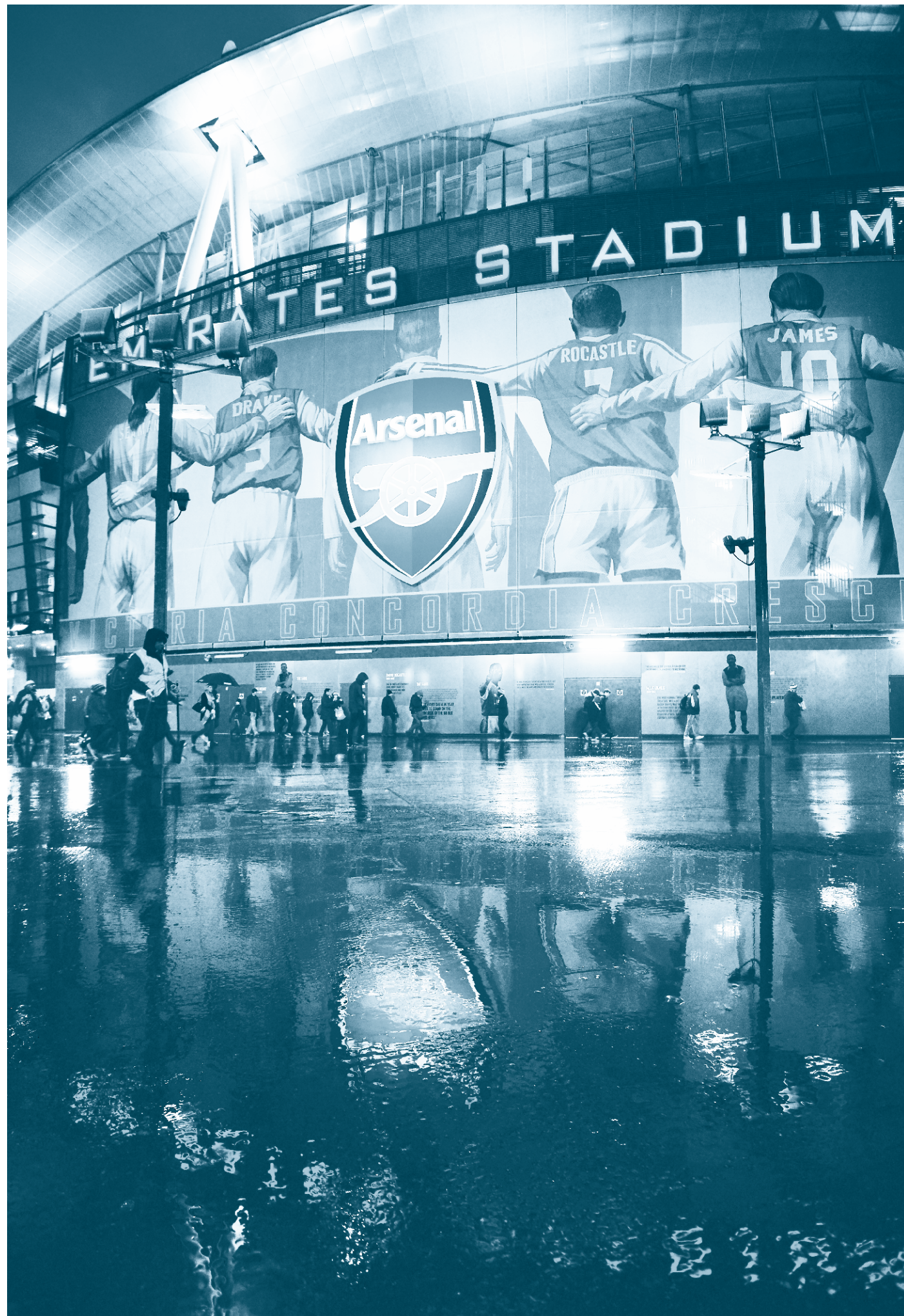
Spectators walk outside the stadium ahead of the English Premier League football match between Arsenal and Queens Park Rangers at the Emirates Stadium in London on December 26, 2014.

even further back, 80 years before the Battle of Sedan, when the world was astonished to witness the overthrow of monarchy and aristocracy by the French Revolution.